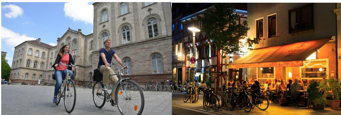
Students and life