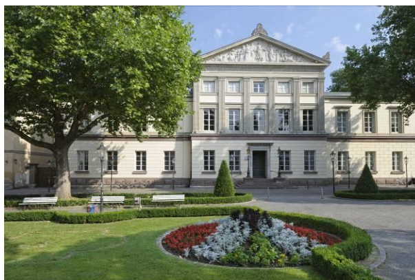
The University

This program focuses on a quantitative analysis of developing economies. By providing students with advanced quantitative methods and skills, it is designed to equip graduates with cutting-edge research techniques, to develop in-depth knowledge of the driving forces behind economic development, to prepare them to think analytically and to evaluate and formulate global and sectoral economic policies.