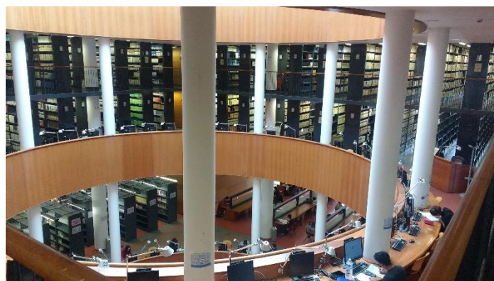
An external and internal overview of the Library of the Social Science Campus.