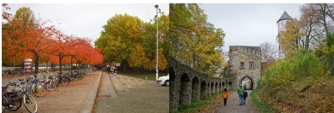
The campus and the city