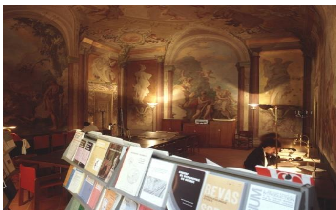
Overview of other libraries of UNIFI© University of Florence