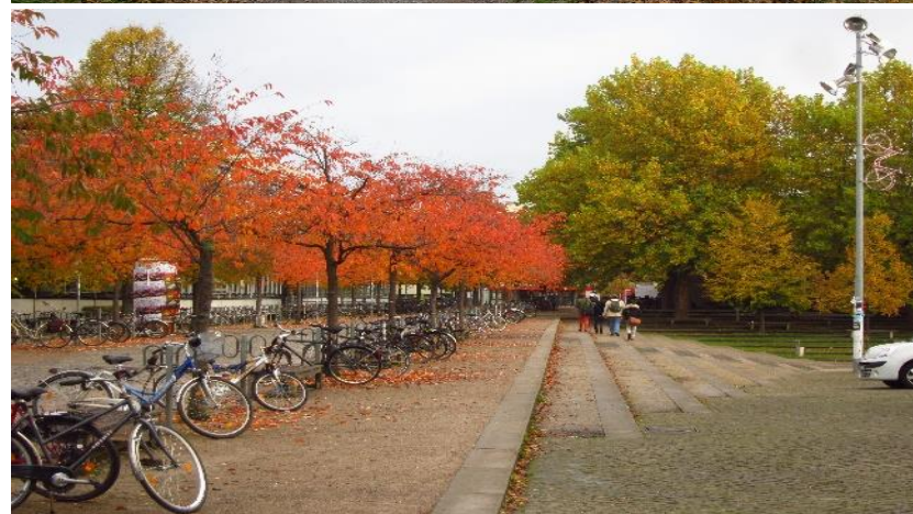
The campus and the city – © University of Goettingen