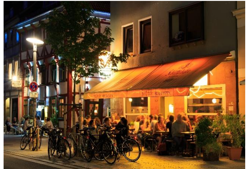
Students and life - © University of Goettingen