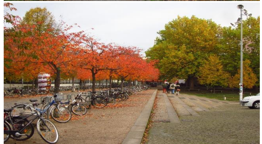
The campus and the city