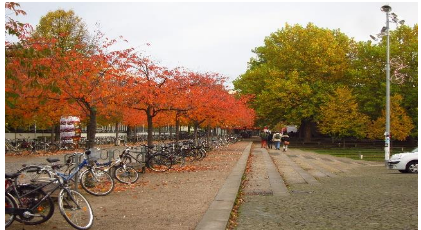
The campus and the city