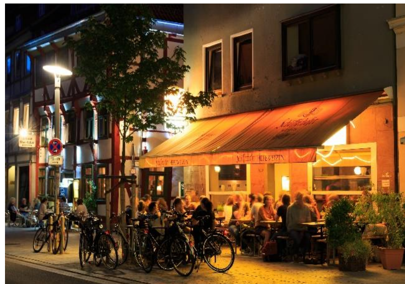
Students and life