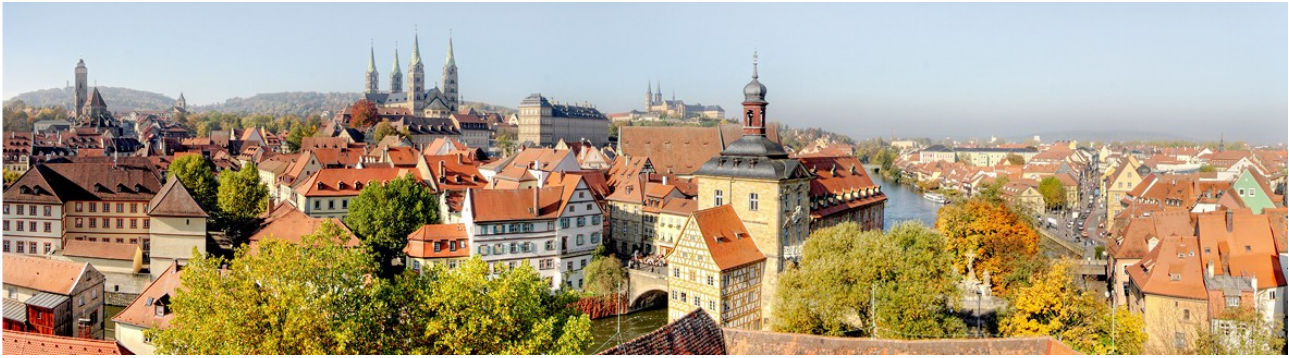
The city