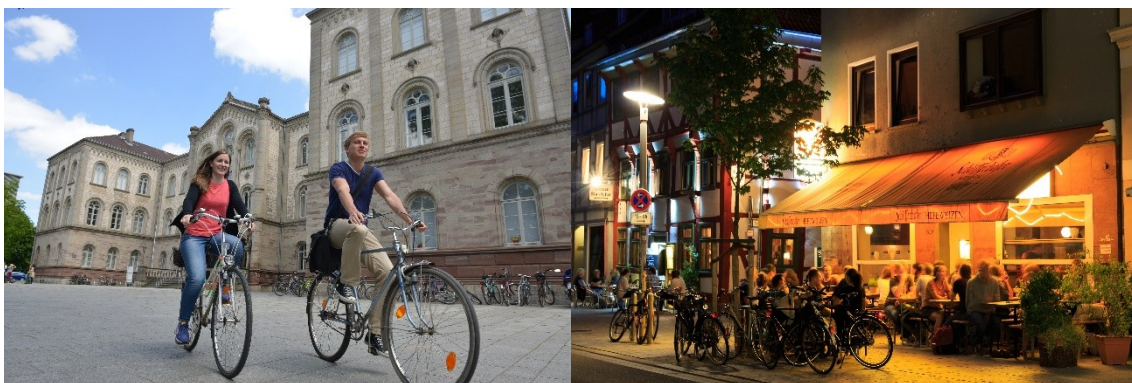
Students and life

After the first academic year in Florence, students spend the entire second year in Göttingen, taking courses from the master's in Development Economics. These courses count towards the degree in the MSc in Economics and Development-Curriculum in Development Economics from the University of Florence. The last semester in Göttingen is dedicated to the completion of the master thesis according to the regulations of the University of Göttingen.