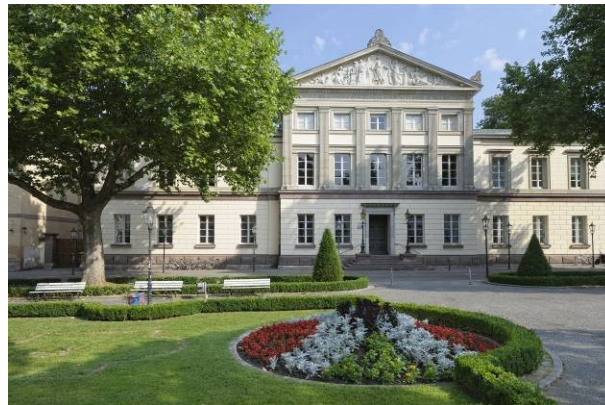
The University

of the university where students spend the second academic year and are recognised by the partner university.