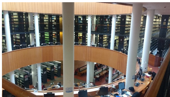
An external and internal overview of the Library of the Social Science Campus.