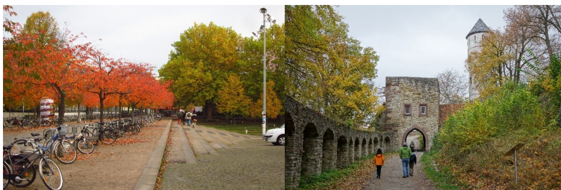
The campus and the city

The opportunities for this program include employment in government and aid agencies working on development issues, international organizations, policy research institutions, international business in multinational companies, and enrolment in a PhD programme.