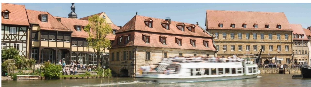
The University

Depending on where students start the Double Degree, they will spend the first academic year at the University of Florence or at the University of Bamberg and the second academic year at the University of Bamberg or at the University of Florence. Master theses comply with the regulations of the university where students spend the second academic year and are recognised by the partner university.