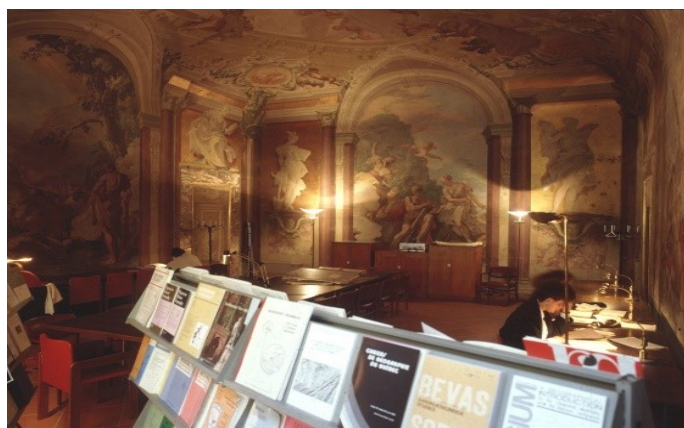
Overview of other libraries of UNIFI