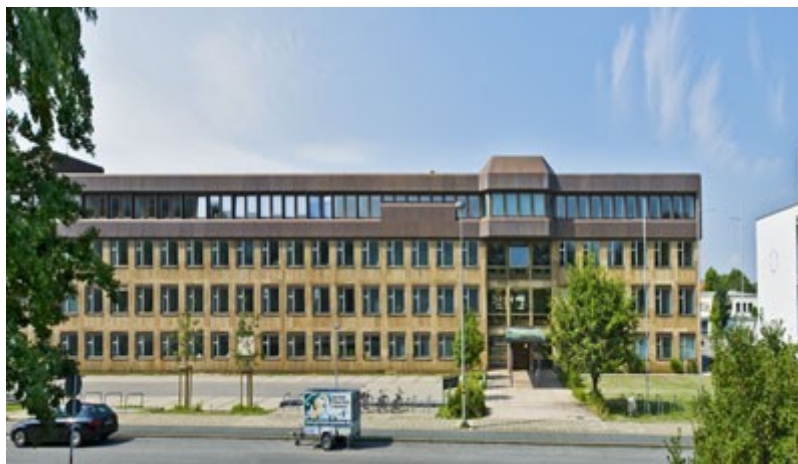
Social Sciences, Economics and Business Administration

The opportunities for this program include employment as a professional economist in a wide range of positions in private economic consultancy agencies, business, finance, national and international organisations and governments, and enrolment in a PhD programme (in Economics and related topics) at leading universities around the world.