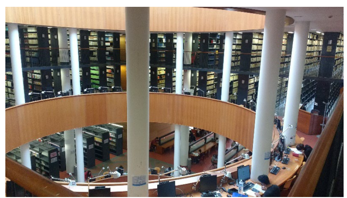
An external and internal overview of the Library of the Social Science Campus.