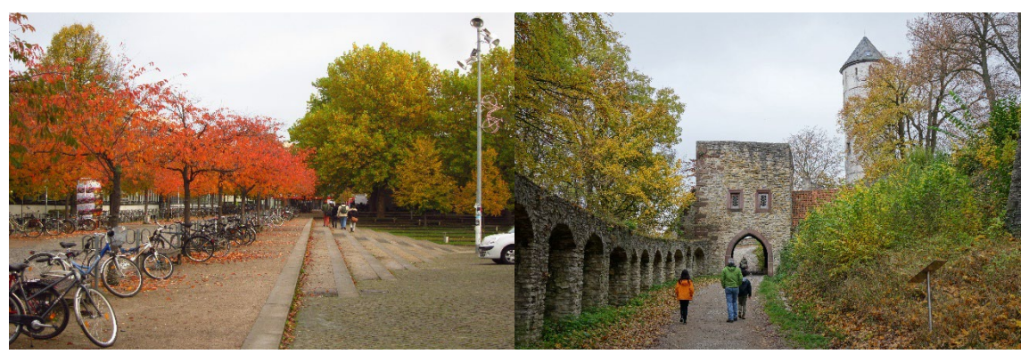
The campus and the city

The opportunities for this program include employment in government and aid agencies working on development issues, international organizations, policy research institutions, international business in multinational companies, and enrolment in a PhD programme.