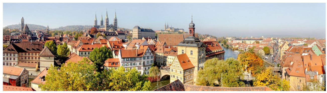
The city - \mathbb C University of Bamberg

After the first academic year in Florence, students spend the entire second year in Bamberg, taking courses from the master's in European Economic Studies. Here students enjoy a high degree of flexibility and can choose among a variety of courses, both theoretical and applied. These courses count towards the degree in the MSc in Economics and Development-Curriculum in Economics from the University of Florence. The last semester in Bamberg is dedicated to the completion of the master thesis.