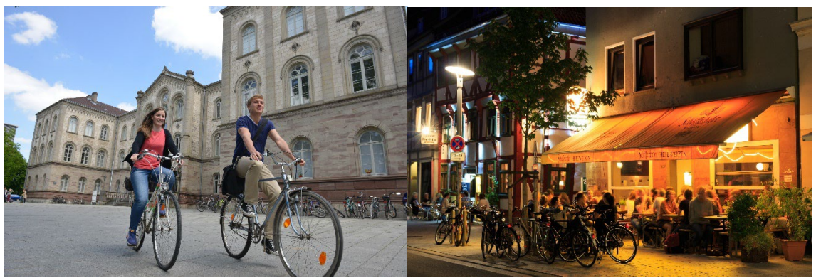
Students and life

After the first academic year in Florence, students spend the entire second year in Göttingen, taking courses from the master's in Development Economics. These courses count towards the degree in the MSc in Economics and Development-Curriculum in Development Economics from the University of Florence. The last semester in Göttingen is dedicated to the completion of the master thesis according to the regulations of the University of Göttingen.