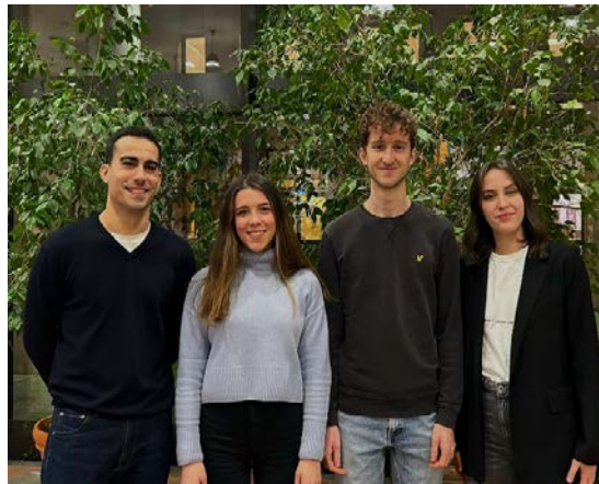
Our Team for year 2024

UniFi has been selected to participate in the latest editions of the Econometric Game, held in Amsterdam (Netherlands) Each year, one of our students is in the Unifi team